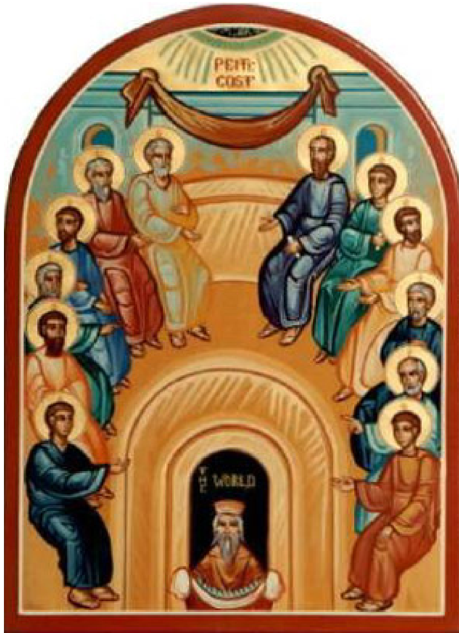
Pentecost (50 days after Pascha)