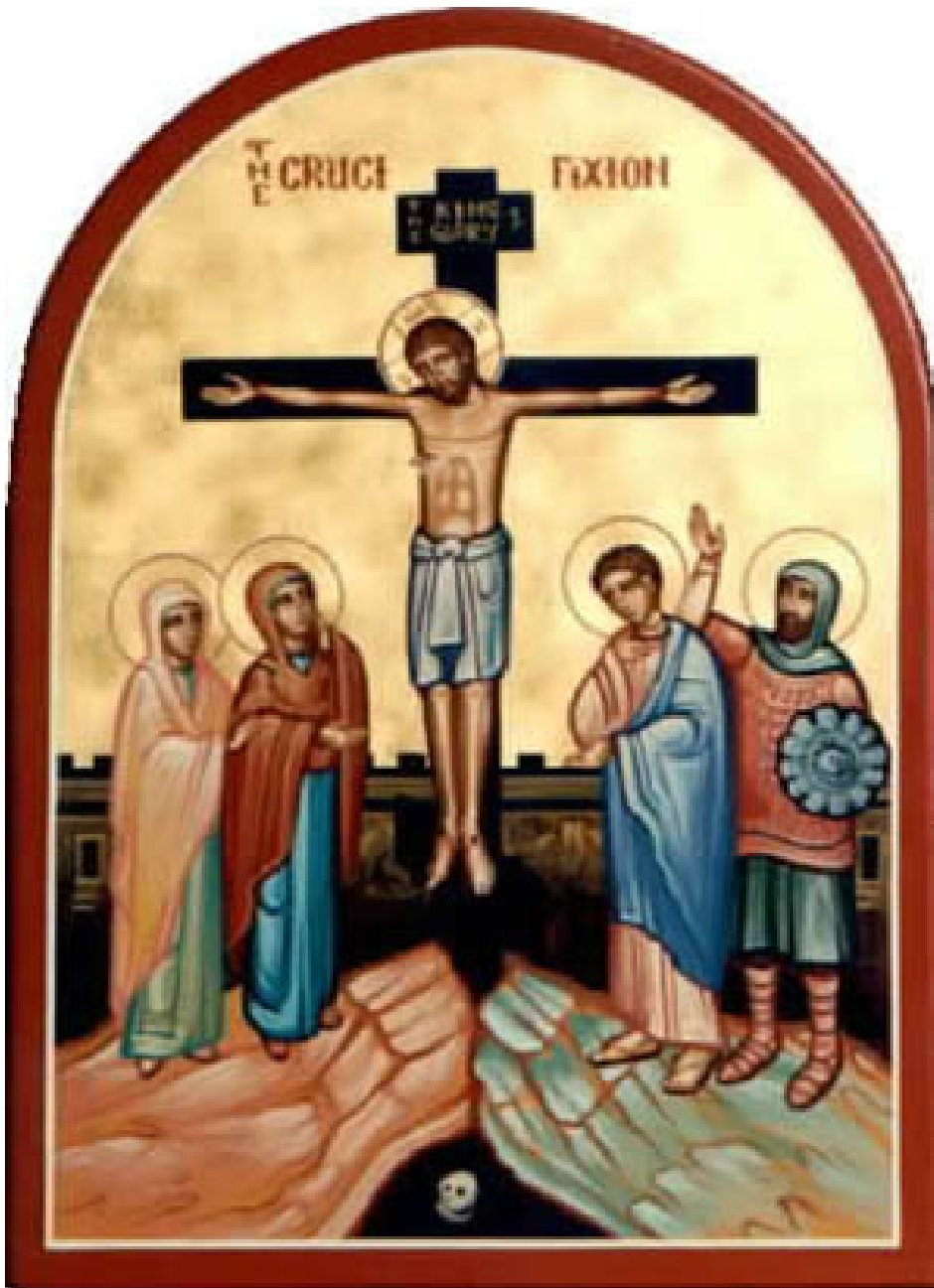
Crucifixion (Great and Holy Friday)