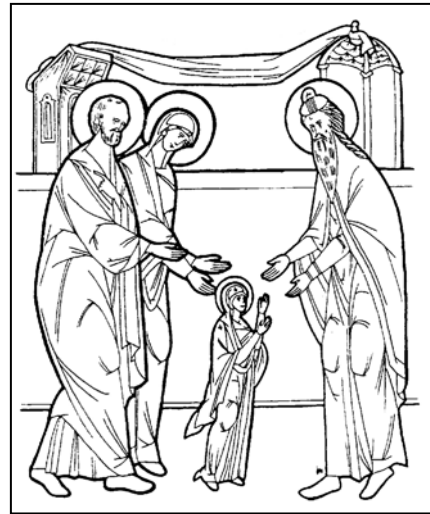
Presentation of the Theotokos (November 21/December 4)