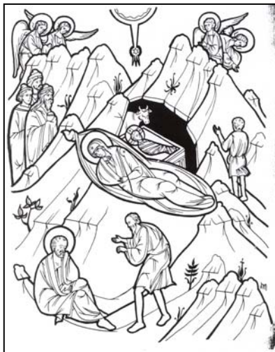
Nativity of Our Lord (December 25/January 7)