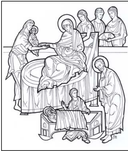
Nativity of the Theotokos (September 8/21)