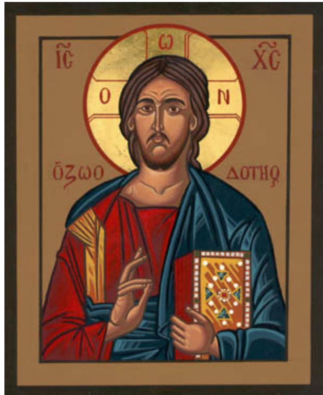
Jesus Christ the Lifegiver

Then said Jesus, “Were not ten cleansed? Where are the nine? Was no one found to return and give praise to God except this foreigner?” And Jesus said to him, “Rise and go your way; your faith has made you well.”