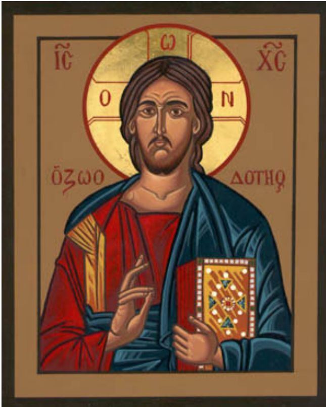
Jesus Christ the Lifegiver