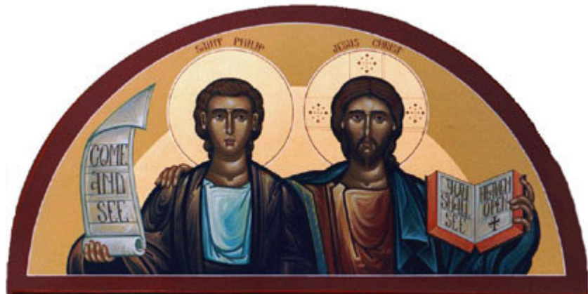
This icon shows Apostle Philip and Christ. Apostle Philip's scroll says "Come and see" while Jesus Christ responds, "You shall see Heaven open."

And he said to him, "Truly, truly, I say to you, you will see heaven opened, and the angels of God ascending and descending upon the Son of man."