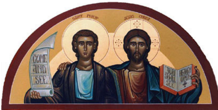
This icon shows Apostle Philip and Christ. Apostle Philip's scroll says "Come and see" while Jesus Christ responds, "You shall see Heaven open."

And he said to him, "Truly, truly, I say to you, you will see heaven opened, and the angels of God ascending and descending upon the Son of man."