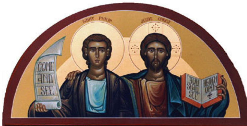
This icon shows Apostle Philip and Christ. Apostle Philip's scroll says "Come and see" while Jesus Christ responds, "You shall see Heaven open."

And he said to him, "Truly, truly, I say to you, you will see heaven opened, and the angels of God ascending and descending upon the Son of man."