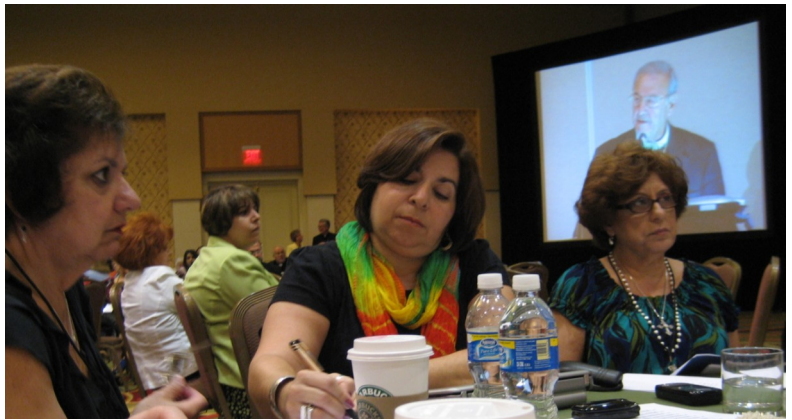
NAB members listening at convention meeting