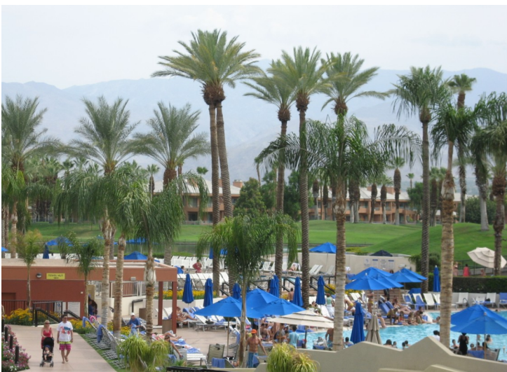
Resort in Palm Desert where convention was held