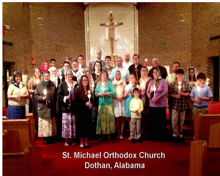
St. Michael Orthodox Church Dothan, Alabama