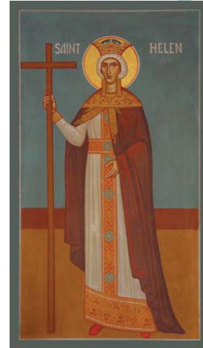
St. Helen found the cross that Jesus died on. For this reason, she is shown holding a cross on her icons.

When St. Helen was old, she took a trip to the Holy Land. The Holy Land is where Jesus lived. She saw all of the holy places we read about in the Bible, like the place Jesus was born in Bethlehem.